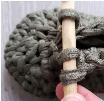
Step 4 – You will have three loops on your hook, yo, and pull through all loops