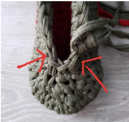
Round 7: Step 1- Join these two stitches

through. Then, skipping the next two stitches, insert your hook into the third stitch (through the top loop as you would for single crochet), yarn over and pull through. You will now have 3 loops on your hook, yarn over one last time and pull through all 3 loops. You will continue the round working in knit stitch, the next stitch will be completed through the “V” of the stitch immediately beside your hook. Complete round, chain 1.