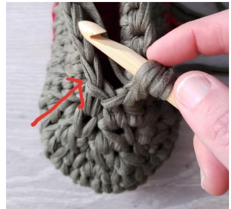
Step 3 - Insert under the double loops shown, yo, pull through