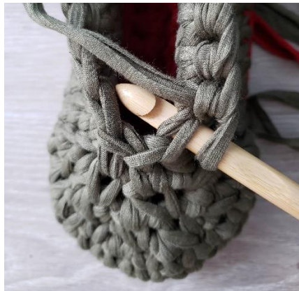
Step 2 - Insert under double loop, yo, pull through